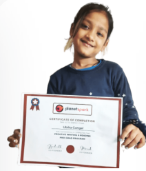
Ubika, Age 7

Excellence Course in Communication Skills