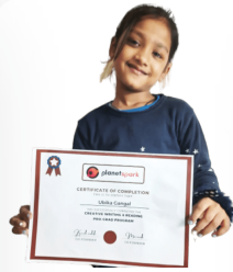
Ubika, Age 7

Excellence Course in Communication Skills