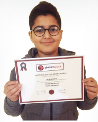
Nakshatra, Age 11

Excellence Course in Communication Skills